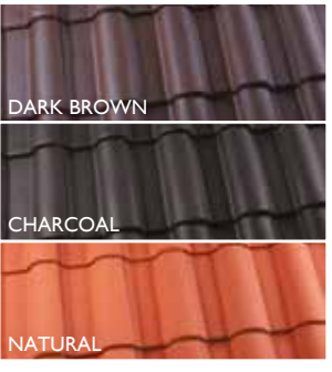
* The colours shown here are reproduced as close to the original as printing technology allows. For best accuracy on colour selection, refer to actual tile.