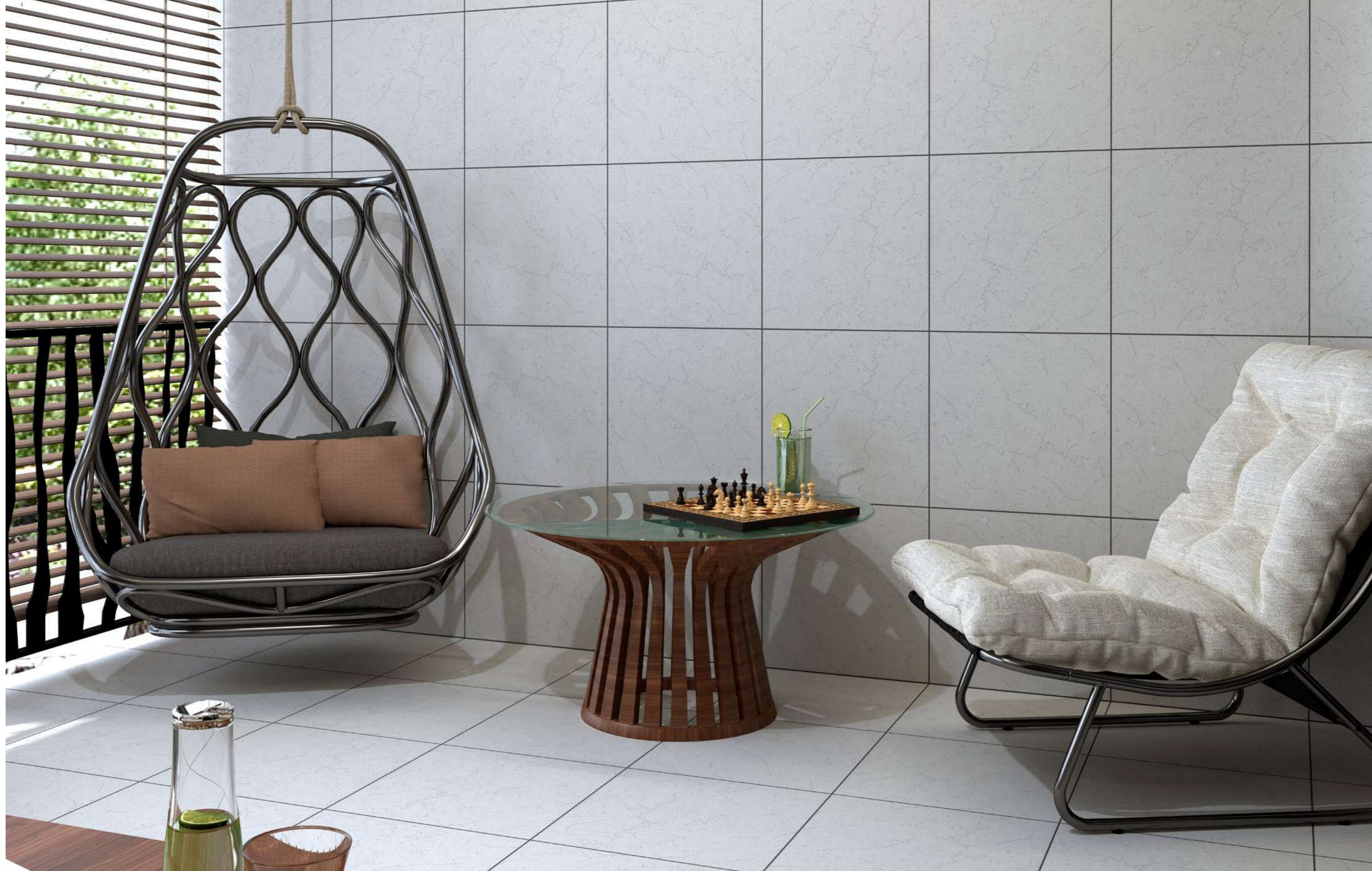
FLOOR & WALL: PGL03 HAZE 40x40cm . matt