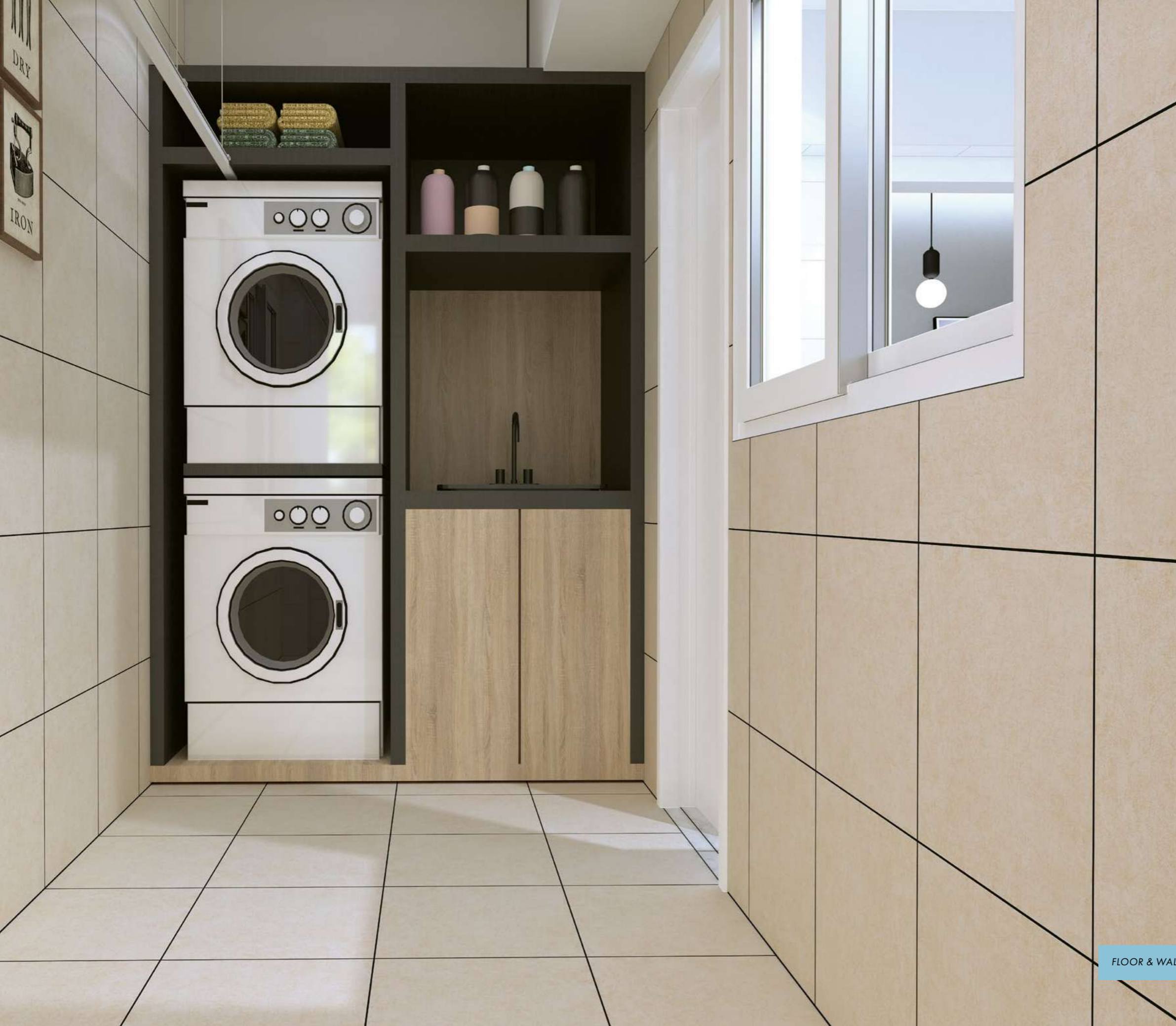
FLOOR & WALL: PGL02 ANTIQUE 40x40cm . matt