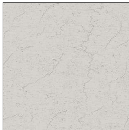
PGL03 40x40cm matt V2